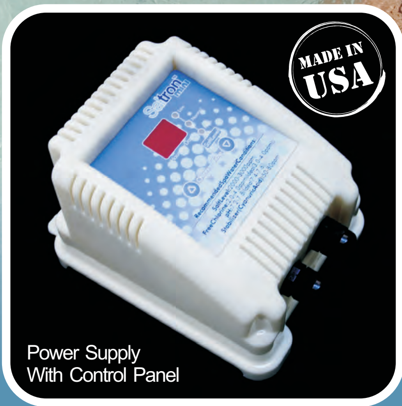
Power Supply With Control Panel

3 easy steps and chlorine is being generated!