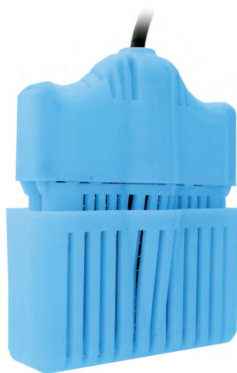
Chlorine Cell and Holder